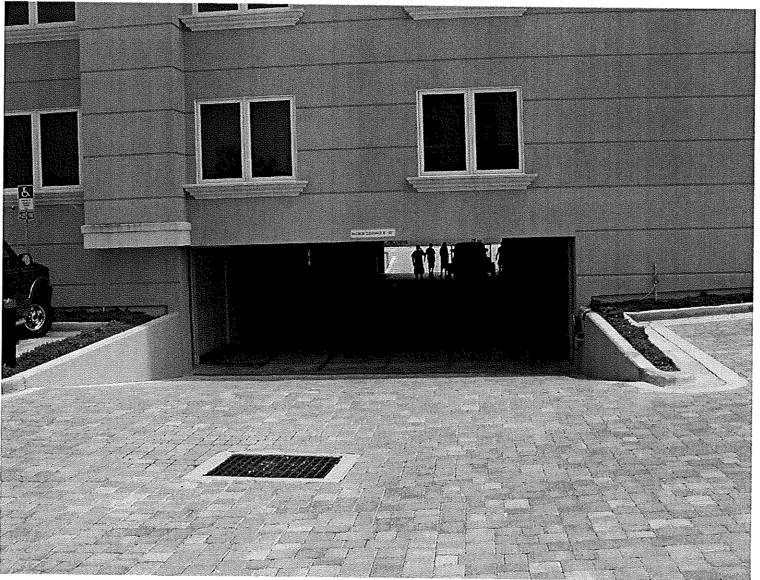
VIEW FROM NORTH SIDE OF BUILDING (DRIVEWAY TO GARAGES ON BOTTOM FLOOR) 06-10-09